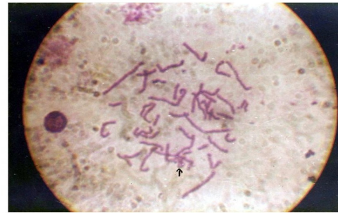
(Table/Fig 3) Photograph showing ring chromosome