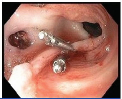
[Table/Fig-1]: Active bleeding seen in the oesophagus. [Table/Fig-2]: Oesophageal ulcer with oozing of blood. (All Image left to right). [Table/Fig-3]: Hemostasis achieved with resolution cline.