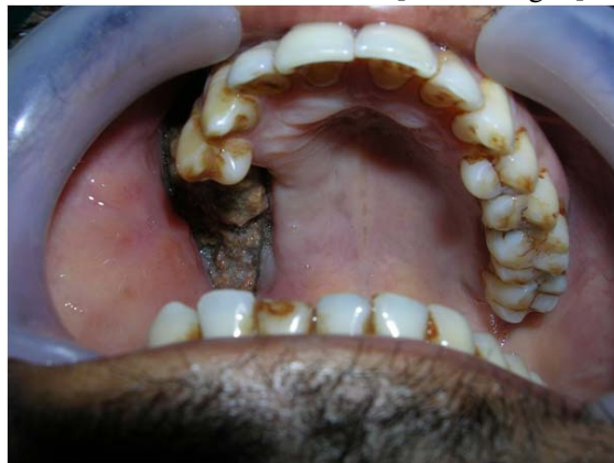
[Table/Fig 2]: Intraoral view showing the necrosed bone at the site of extraction.

The patient was a chronic tobacco chewer since five years. The medical history of the patient was non contributory and the vital signs were stable. Inspection revealed a diffuse irregular swelling on the right side of the maxilla and the zygoma, approximately 5 x 4 cm in size, with multiple discharging sinuses and erythema on the right cheek and the infraorbital region. The swelling was bony hard in consistency, with signs of inflammation. The right lower eyelid was stretched due to a puckered appearance around the infraorbital sinuses.[ Table/ Fig. 1]