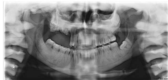
[Table/Fig 3]: Pantomograph revealing increased density of maxilla and mandible with extensive osteosclerosis in right maxilla.

Intra oral examination revealed a mucosal defect in the right maxillary molar region, with exposed necrotic bone extending upto the maxillary tuberosity. The right maxillary molars were missing. [Table/Fig.2] The radiographical examination of the jaws was done.