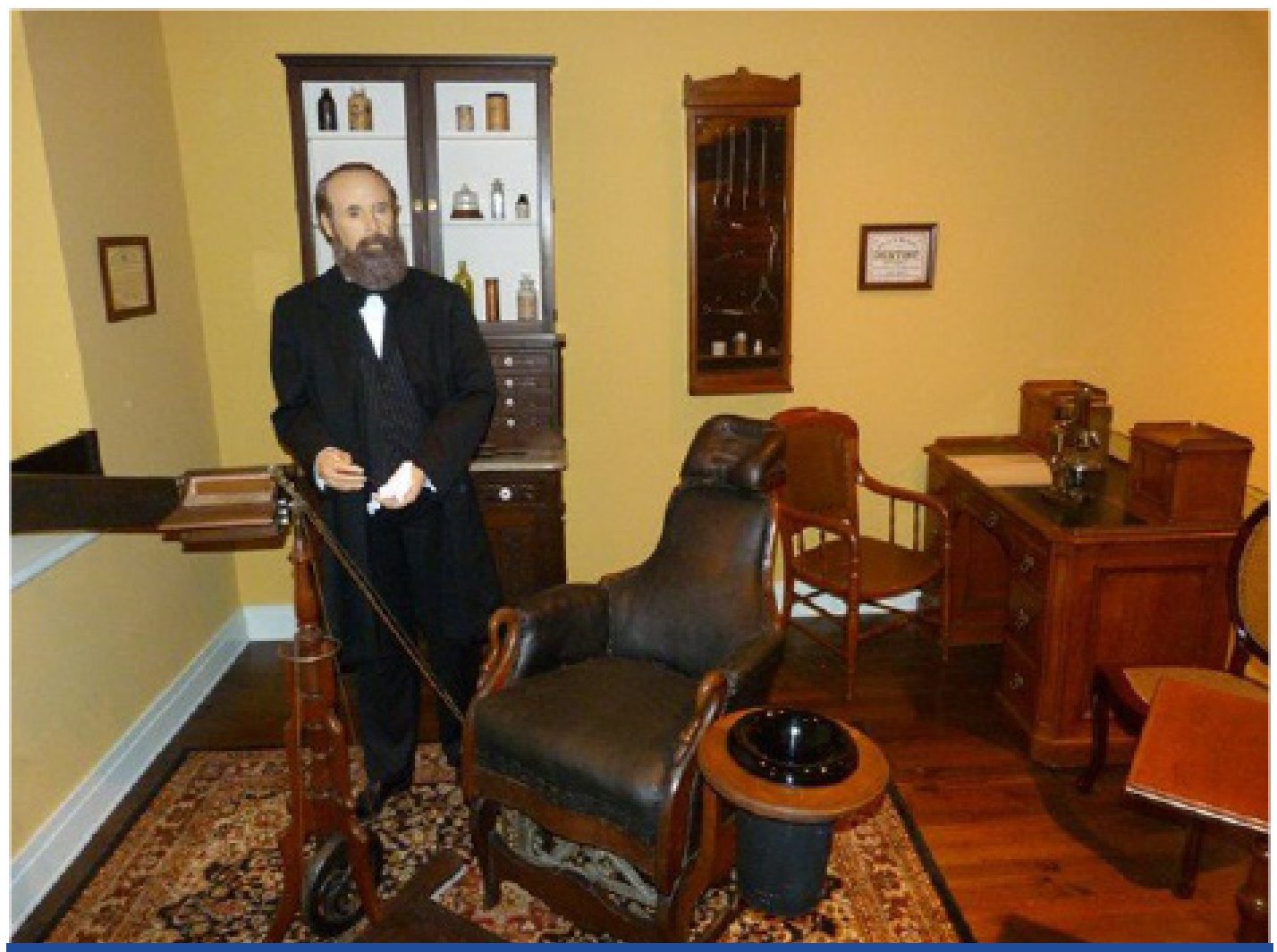
[Table/Fig-1]: Dr. G.V. Black in his dental office

As we all know prevention is better than cure, a case in point from 1891 when Black introduced an idea to prevent recurrence of dental caries by publishing his concept 'EXTENSION FOR PREVENTION' in an article in Dental Cosmos. This was to obtain self cleansing benefit to prevent food lodgment In Northwestern University once Dr. Black told his students that "The day is surely coming and perhaps within the lifetime of you young men before