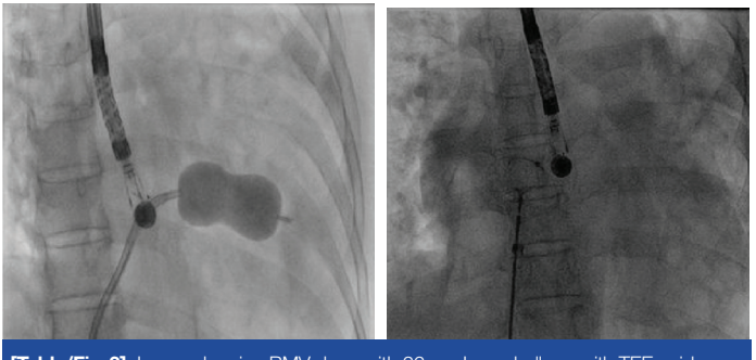
[Table/Fig-3]: Image showing BMV done with 26mm Inoue balloon with TEE guidance. [Table/Fig-4]: Image showing ASD close with a 30mm Cocoon ASD Septal Occluder with TEE support.

the procedure for interatrial septal puncture to complete BMV and also to guide device closure [Table/Fig-2]. BMV was done on 28/12/15 [Table/Fig-3]. ASD device closure was done with a 30mm COCOON on 28/12/15 [Table/Fig-4]. Post-operatively the patient was managed with diuretic Furesemide. There was no evidence of a clot or pericardial effusion. Her medications were optimized and she was informed about her medical condition and the prognosis and was discharged. She was asked to report immediately in case of any chest discomfort, breathlessness, giddiness. A follow-up 40 days showed good general condition and no symptoms.