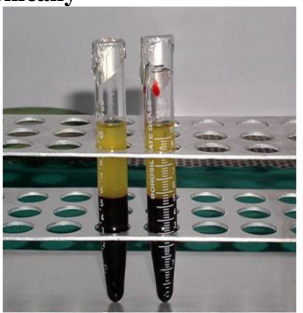
[Table/Fig 2]: After first Centrifugation

[Table/Fig 1]: Pre-operative view radiographically