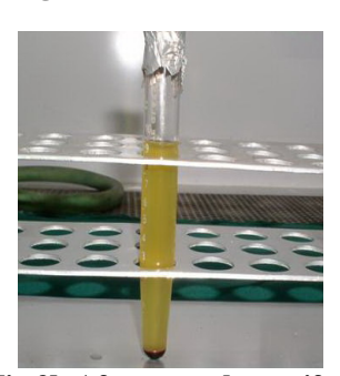
[Table/Fig 3]: After second centrifugation