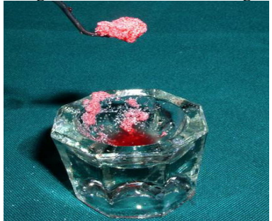
[Table/Fig 4]: PRP and bone graft (Osteogen) combination