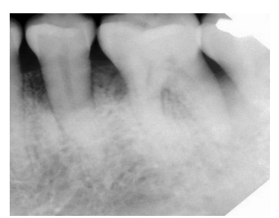
[Table/Fig 5]: Radiograph showing 9 months post-operative view