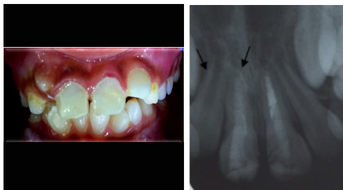
[Table/Fig-5]: Postoperative view showing esthetics restoration with composite resin restoration wrt 11 & 21. [Table/Fig-6]: Intraoral periapical radiograph at 12 month time interval wrt 11 & 21, which showed better root growth & dentin thickness in biodentine than mineral trioxide aggregate.

For a successful endodontic treatment, proper clinical and radiographic assessment is mandatory particularly in young permanent teeth following trauma [2]. In such teeth ideal choice of treatment is apexification procedure. Traditionally, apexification was introduced by filling canal with calcium hydroxide and iodoform mixture for a period of 3 to 6 months [3]. The main disadvantage being is dressing needs to be change frequently to induce apical healing and time required is long [2]. Newer bioactive materials like MTA and Biodentine are introduced to induce artificial apical barrier in a single visit.