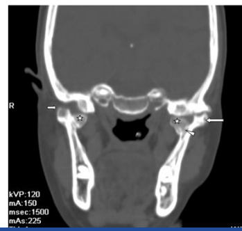
[Table/Fig-1]: Axial section of CT scan showing pathognomonic feature of osteochondroma with a lesion composed of cortical (arrow) and medullary (5-point star) bone protruding from the postero-medial aspect of neck of bilateral mandibular condylar processes (left > right) showing continuity with the cortex and medulla. [Table/Fig-2]: In coronal CT scan bony protuberance (5-point star) project away from the TMJ/ Condylar head (arrow) i.e., epiphysis with no involvement of it. Margins of this lesion appear to be calcified and show continuity with cortex. Lesion showing continuity (arrowhead) with medullary canal.