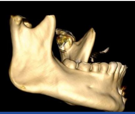
[Table/Fig-3]: 3D CT scan showing coronoid process (arrow) and head of mandibular condyle (arrowhead) appear normal. [Table/Fig-4]: 3D CT scan showing head of mandibular condyle (arrow head) and left side and right side lesion (arrows). [Table/Fig-5]: 3D CT scan showing lesion on the medial aspect of left mandibular condyle (arrow). The lateral side of ramus on right side appears normal.

transformation [5]. Our patient was found to be asymptomatic with no clinical signs. A diagnostic and pathologic characteristic of this lesion often reflects on radiographic appearance. Continuity of lesion with bone cortex and medullary canal is characteristic feature of OC which can be optimally depicted on three-dimensional imaging capability of CT [5].