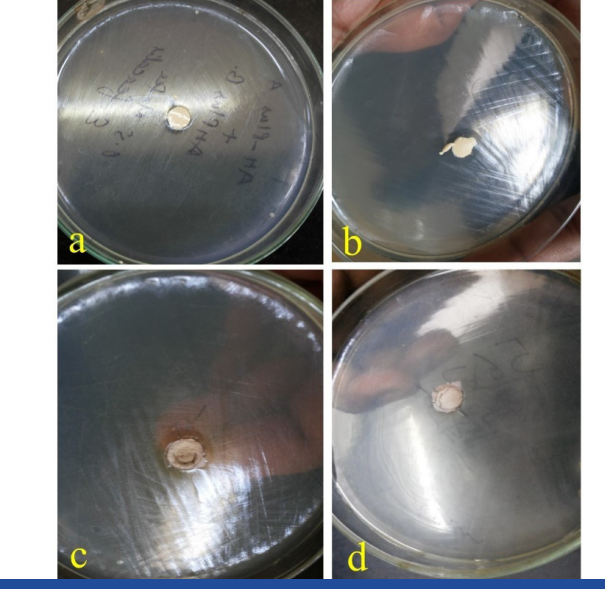
[Table/Fig-1a-d]: ADT of different sealers at 24 hours. a-AH Plus, b- CRCS, c- MTA Fillapex, d- Gutta Flow 2

ADT showed statistically significant difference in microbial inhibition among AH plus, CRCS and MTA Fillapex. A zone of inhibition at