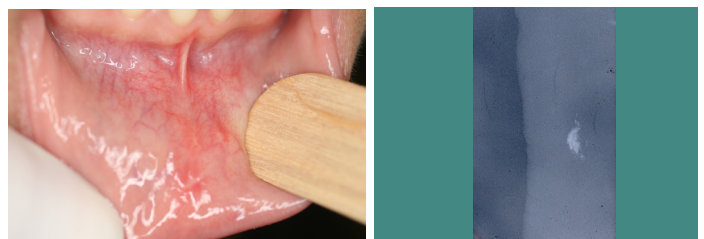
[Table/Fig-5]: Intraoral examination of the lip showing foreign body. [Table/Fig-6]: Preoperative radiograph showing dental fragments in the lower lip.