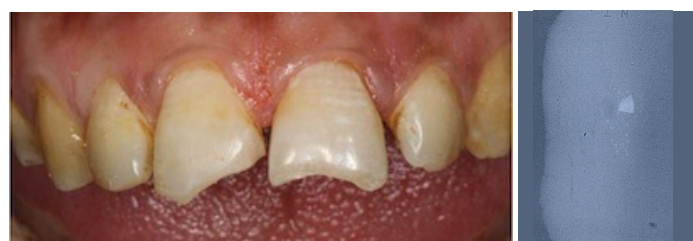
[Table/Fig-1]: Intraoral view of the fractured teeth. [Table/Fig-2]: Preoperative soft-tissue radiograph revealing tooth fragment in the lower lip.

A 26-year-old female patient presented at the emergency room of the Department of Endodontics, School of Dentistry, University