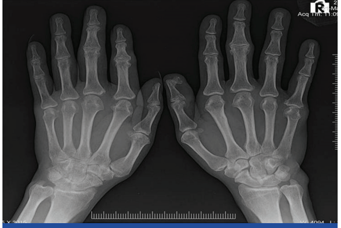
[Table/Fig-3]: Radiograph of both hands shows well defined, exophytic, osseous lesion arising from medial aspect of distal phalanx of right thumb with adjacent soft tissue swelling without continuity of lesion with medulla of distal phalanx.