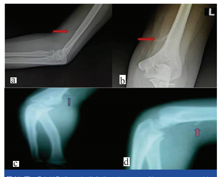
[Table/Fig-4]: (a,b) Radiograph of left elbow shows a small bony excrescence arising from anteromedial margin of distal 1/3<sup>rd</sup> of left humerus projecting towards elbow joint. (c,d) Radiograph of right elbow shows a small bony excrescence arising from anterior margin of distal 1/3<sup>rd</sup> of right humerus projecting towards elbow joint/

In standard radiographs, Nora's lesion is generally well marginated, but with lack of communication with underlying medullary canal [6] and lacks characteristic orientation away from nearby physis [Table/Fig-1], whereas osteochondromas have communication with medullary canal and shows characteristic orientation away from physis and more common in long bones than distal extremities [4,5,7].