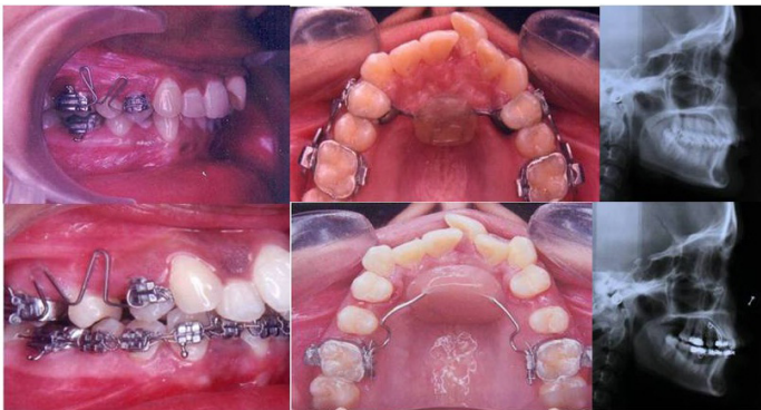
[Table/Fig-1]: K-Loop distalization: Top row- before distalization; Bottom row- after distalization.

After two months the appliance was reactivated 2mm to further distalize the molars. Since the distal end of the wire was not bent, it was easy to remove from the molar tube. In most cases, one reactivation was sufficient to get the molars into super Class I relationship with duration of approximately 5-6 months. Once the molars were distalized, K-loop was removed and the molars were stabilized in their new positions with transpalatal bar and a stopper in the arch wire just mesial to buccal tube.