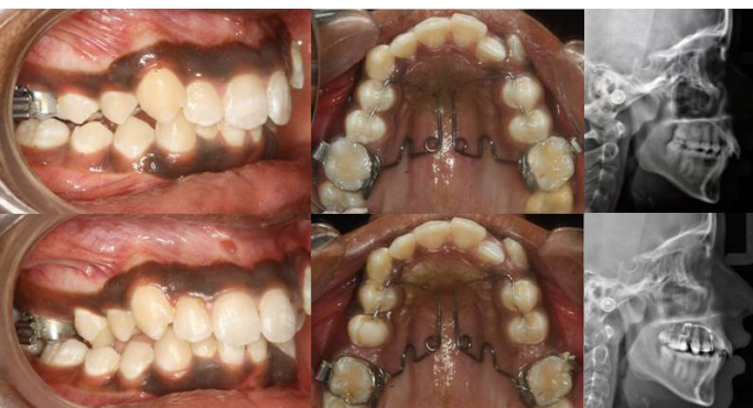
[Table/Fig-2]: Pendulum appliance: Top row- before distalization; Bottom row- after distalization.