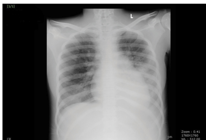
[Table/Fig-1]: CXR-PA view showing pneumonia involving the left mid and lower lung fields.

She was started on 4 drug regimen of anti-tubercular therapy. She improved clinically with treatment and chest x-ray [Table/Fig-3] was repeated after 4 weeks of anti-tubercular therapy which was found to be normal. She was then discharged and was asked to come for follow-up.