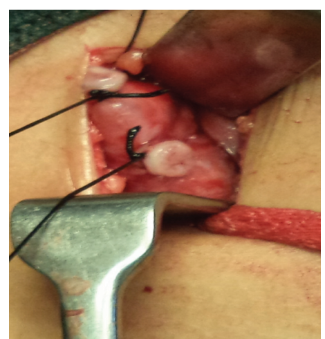
[Table/Fig-1]: (1) The two bases of the appendix seen at frontal disposal. [Table/Fig-2]: The divided and undivided stumps. [Table/Fig-3]: Completed appendectomy showing the two divided bases