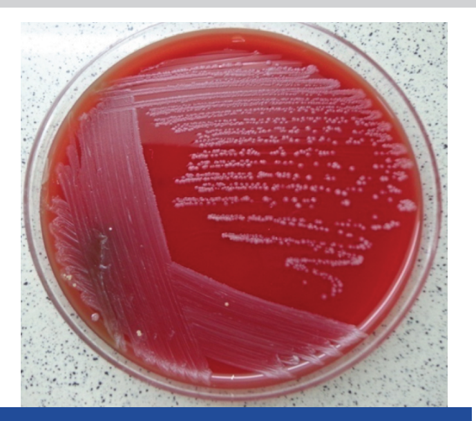
[Table/Fig-2]: Colony morphology of C.amycolatum on blood agar