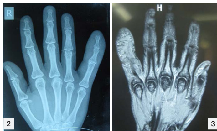
[Table/Fig-2]: X- ray showing a diffuse soft tissue swelling with normal bone architecture [Table/Fig-3]: MRI revealed diffuse hypertrophy of subcutaneous fat enclosing entire little finger in the palmar aspect – macrodystrophia lipomatosa

Keywords: Benign, Digits, Pacinian corpuscles, Tumour