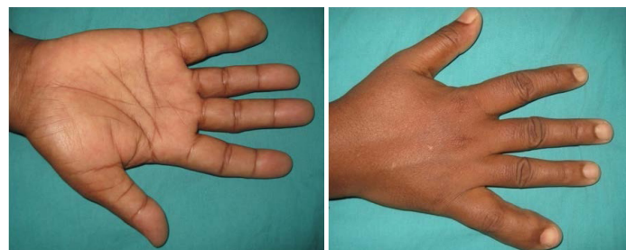
[Table/Fig-1a&b]: Clinical photograph showing macroductyly of right little finger

MRI revealed diffuse hypertrophy of subcutaneous fat enclosing entire little finger in the palmar aspect – macrodystrophia lipomatosa, mild