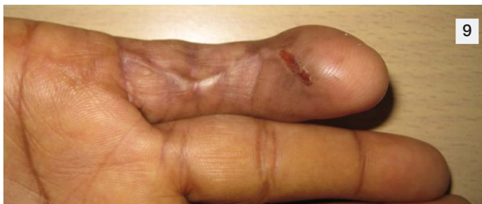
[Table/Fig-9]: A 3 month follow-up picture

number of pacinian corpuscles separated by lobules of mature adipose tissue and areas of haemorrhage-type B by Michels & Albert's classification [Table/Fig-7,8].