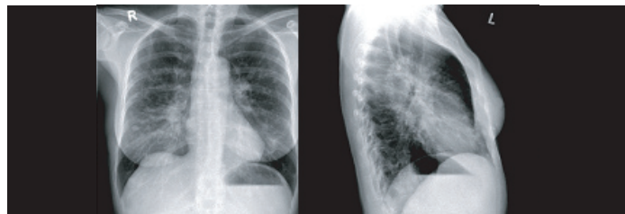
[Table/Fig-1]: Plain chest X-ray showing the presence of increased interstitial pronounced opacity (in PA and lateral view)

Due to a 6 month history of recurrent bronchitis associated with shortness in breath a female patient in the mid-50s was referred for radiographic evaluation. The radiographic examination of chest showed rounded lesions at the level of the right central lobe and increased interstitial reticular opacity [Table/Fig-1]. The patient's history and the radiographical findings described were suspicious for malignant disease. Thus, the patient was admitted and subjected to further work-up (tumour search). A CT scan of the lungs confirmed the presence of intrapulmonary rounded nodular opacities of up to 1.5 cm in diameter corresponding to the X-ray findings [Table/Fig-2]. For histocytopathological confirmation of the origin of the nodules, a bronchoscopy was initiated. Unfortunately, the bronchoscopy with brush biopsy yielded the unspecific finding of an alveolar hyperplasia accompanied by lymphocytic and granulocytic inflammatory reaction. Finally, the patient was submitted to diagnostic partial lung resection. The histopathological evaluation of the resected, paraffin-embedded tissue revealed an overlaying, nearly confluent nodular structure of strongly hyalinized tissue with anthracotic pigmentation and peripheral accumulation of epithelioid cell granulomas accompanied by infiltration of lymphoid cells. No PAS-positive micro-organisms were detectable [Table/Fig-3a&b].