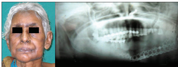
[Table/Fig-9]: Follow-up photograph of the patient showing restored functional and aesthetic form [Table/Fig-10]: Postoperative orthopantomograph

other co-morbidities, a novel and innovative modification was done on the surgical table. Approximately 5.5 cm iliac crest was harvested and was split sagittally to attain 11 cm of graft to restore the defective site [Table/Fig-7].