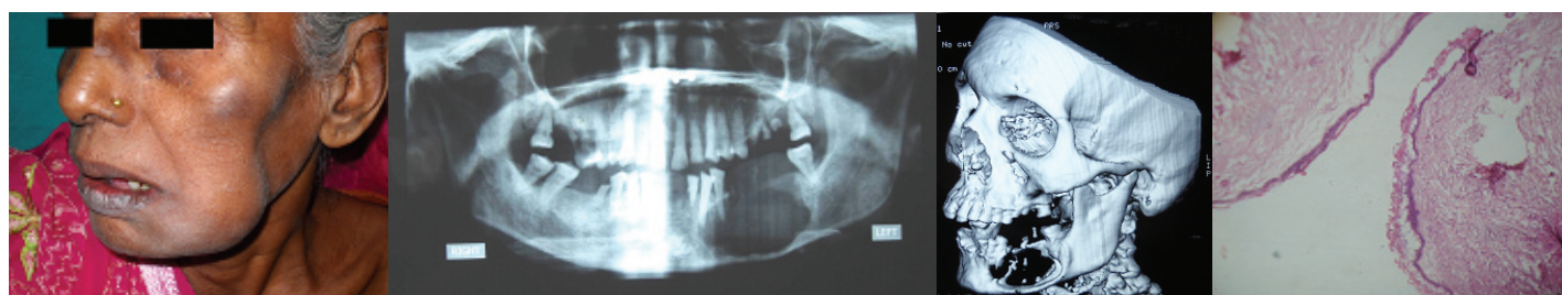
[Table/Fig-1]: Preoperative extra-oral photograph showing the extent of the tumour [Table/Fig-2]: Orthopantomogram revealing a well-defined unilocular radiolucency [Table/Fig-3]: 3D Computed tomography reconstruction showing the defect created by the lesion [Table/Fig-4]: Photomicrograph revealing characteristic features of unicystic ameloblastoma

Along with the resected mandible, teeth numbered 32, 33, 34 and 38 were also removed during the surgery [Table/Fig-6]. Following resection, there was a defect measuring approximately 11 cm considering the age of the patient age, the size of the defect and