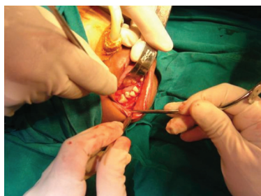
[Table/Fig-8]: Intraoperative view showing extraction of 46