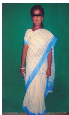
[Table/Fig-2]: Short stature