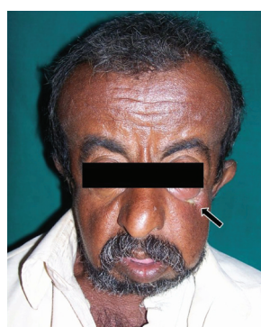
[Table/Fig-12]: Extraoral view showing features of pycnodysostosis