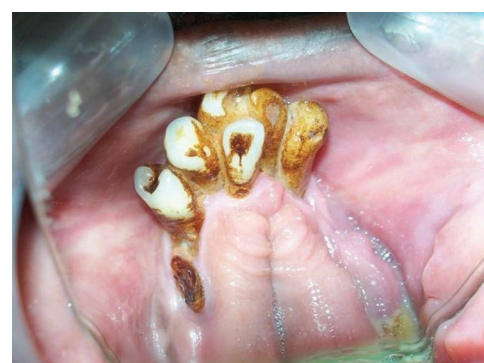
[Table/Fig-13]: Grooving of palate and pus discharge irt 27