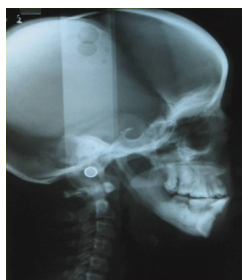
[Table/Fig-7]: Lateral skull view showing hockey stick mandible