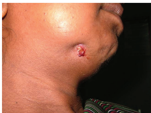
[Table/Fig-1]: Extraoral draining sinus

A 36-year-old male patient reported to our unit with a discharge below the left eye since 2½ months [Table/Fig-11] and a hypomobile mandible. Patient gives a history of swelling on the left side of the face since three months followed by extraoral pus discharge since 2½ months. General examination revealed short stature, short stubby fingers and toes. The extraoral examination revealed facial dysmorphism, limited mouth opening and pain at the point of fracture of mandible. The intraoral examination revealed partially edentulous dentition with missing 16, 17, 18, 24, 25, 26, 27, 32, 35, 36, 37, 38, 42, 47 and 48, malposed teeth, narrow maxillary and mandibular arches, grooving of palate and pus discharge in relation to 27 [Table/Fig-12,13] and chronic periodontitis. The orthopantomograph revealed obtuse angle of mandible and pathological fracture of the left ramus of the mandible. The mandibular condyles and coronoid apophyses were elongated [Table/Fig-14]. The lateral skull view [Table/Fig-15] revealed typical hockey stick appearance of mandible. Based on history, clinical and radiological features, a diagnosis of Pycnodysostosis with pathological fracture of left ramus of the mandible and chronic osteomyelitis in relation to 27 was made. Informed consent was taken from the patient prior to surgery. The patient was started on intravenous Amoxycillin 500mg and Metronidazole thrice daily preoperatively. The patient