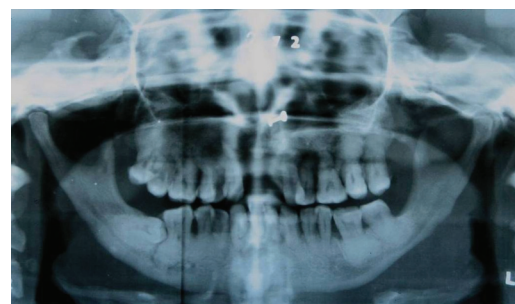
[Table/Fig-6]: Orthopantomograph showing osteomyelitis irt 46 and 47