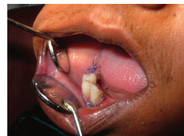
[Table/Fig-9]: Intraoperative view showing surgical removal of 47 and decortication [Table/Fig-10]: 1 week postoperative healing of surgical site