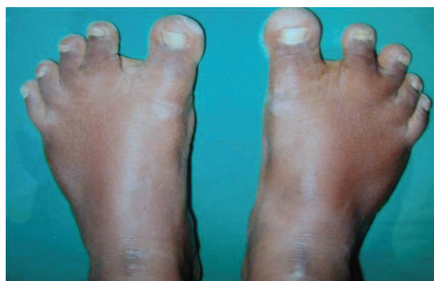
[Table/Fig-3]: Webbing of 2 nd and 3 rd digits