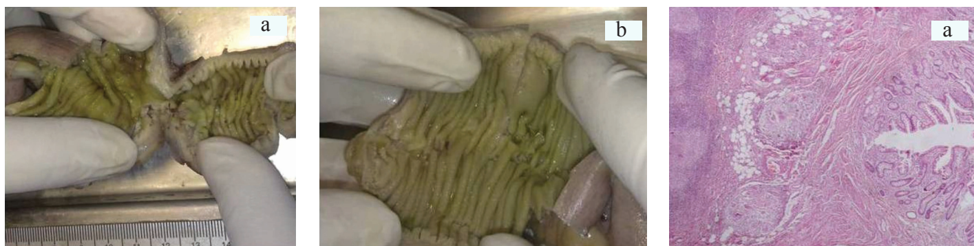
[Table/Fig-1a]: Gross specimen showing a stricture [Table/Fig-1b]: Grossly visible nodular area with overlying normal appearing mucosa [Table/Fig-2a]: Section from intestine showing epithelioid cell granulomas in submucosa (H&E x40)

Majority of nodules presenting in ileum, especially those that are