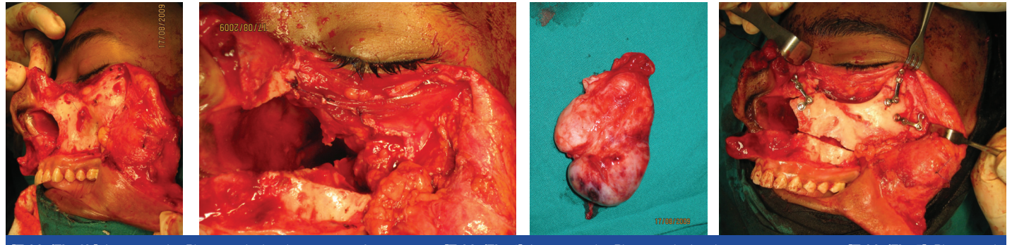
[Table/Fig-3b]: Intraoperative Photograph showing exposure for osteotomy [Table/Fig-4]: Intra operative Photograph showing access osteotomy., [Table/Fig-5]: Photograph of excised tumour mass [Table/Fig-6]: Intra operative photo showing fixed osteotomised segment with miniplates

the lesion was obtained by extending the cuts already made into a standard or unilateral Le Fort I osteotomy. This procedure provides an access to the entire central and lateral aspects of the anterior skull base [Table/Fig-4]. It is also possible to move the orbito-maxillary components separately. The incision can also be extended over the frontal region if a frontal craniotomy is required for access to the anterior fossa.