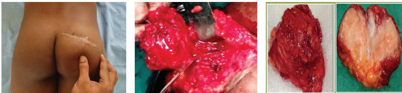
[Table/Fig-18]: Case 6- Preoperative photograph right gluteal region [Table/Fig-19]: Case 6-Perioperative photograph [Table/Fig-20]: Case 6 – Excised specimen- gross and cut section of the tumour

estrogen [12]. Additionally, desmoids regress on tamoxifen and oral estrogen therapy. Women with desmoid tumour have regression of their lesions after attaining menopause.