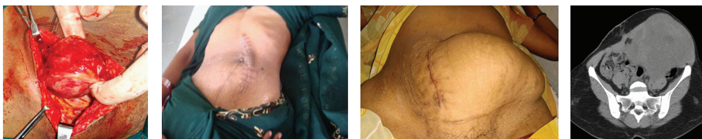
[Table/Fig-10]: Case 3 -Perioperative picture showing the tumour in the rectus [Table/Fig-11]: Case 3 -Postoperative photograph., [Table/Fig-12]: Case 4- Preoperative photograph [Table/Fig-13]: Case 4- CECT image of the tumour