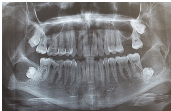
[Table/Fig-1]: Radiological view of the bilateral intraosseous epidermoid cysts

A 24-year-old patient was referred to our clinic for treatment of impacted wisdom teeth. The patient had odontogenic pain on upper and lower right jaw. Clinical examination showed that upper and lower right first molars have deep caries and pulpitis pain. The wisdom teeth were not seen in mouth clinically. The patient anamnesis gives no wisdom teeth extraction story in past. The orthopantomograph was taken to see the positions and situations of all wisdom teeth. Bilaterally impacted teeth surrounded by large radiolucency were detected by orthopantomograph [Table/Fig-1].