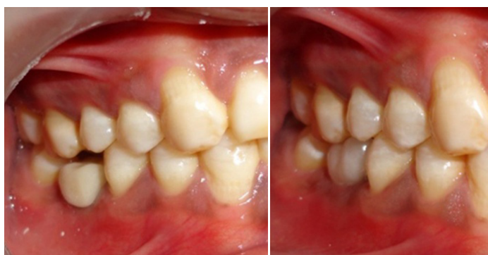
[Table/Fig-4]: Temporization done and prosthesis kept out of occlusion [Table/Fig-5]: Final prosthesis cementation done