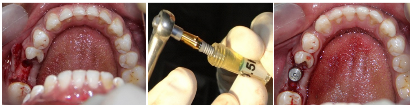
[Table/Fig-1]: Osteotomy site preparation done [Table/Fig-2]: Implant surface treated with activated PRP [Table/Fig-3]: Implant placement done with healing abutment in the prepared osteotomy site