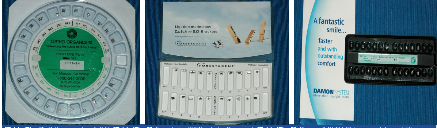
[Table/Fig-1]: Ortho organiser (USA), [Table/Fig-2]: Forestadent<sup>™</sup>(Pforzheim Germany), [Table/Fig-3]: Damon 3 SLTM (Sybron dental specialities Ormcocorp California)