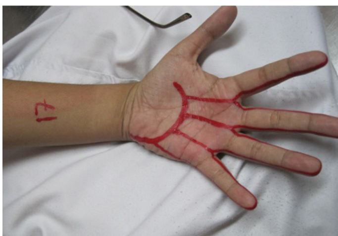
[Table/Fig-4]: Superficial palmar arch

A feedback was obtained from the students by using a structured questionnaire. The respondents' agreements / disagreements were noted with a set of statements by using a six point Likert scale.