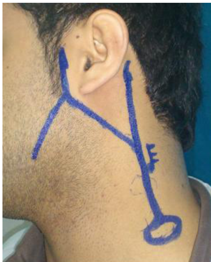
[Table/Fig-5]: Fomation of external jugular vein

Seventy-seven students answered the feedback questionnaire. The data was analyzed by using the SPSS software. 98.7% of