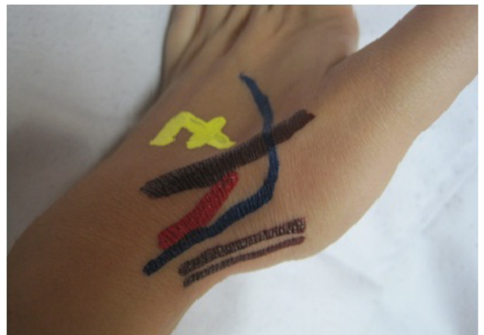
[Table/Fig-1]: Anatomical snuff box

A written consent from the volunteer students and ethical clearance for the project from the institutional review board were obtained.