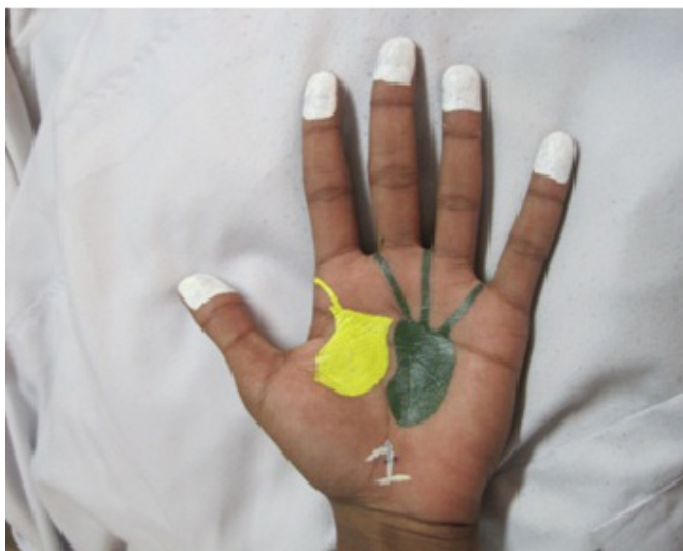
[Table/Fig-2]: Fascial spaces of hand