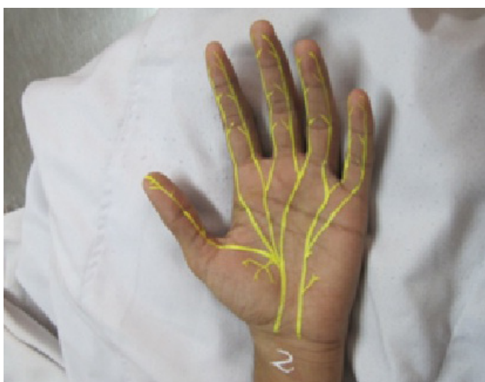
[Table/Fig-3]: Nerve supply of hand