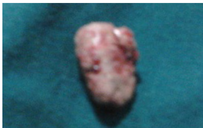
[Table/Fig-3]: Operative film showing fecolith