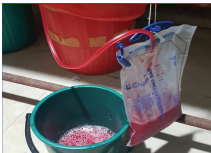
[Table/Fig-4]: Gross haematuria after formic acid poisoning.

revealed a significant number of RBCs without any dysmorphic RBCs and mild proteinuria (Protein 1+, Blood 3+).