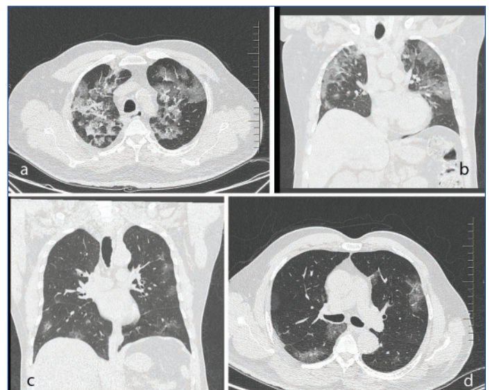
[Table/Fig-5]: CT scan picture a&b) Multifocal discrete and confluent patches of ground glass opacities, mass like consolidation and interlobular septal thickening noted in bilaterally predominantly in peripheral distribution, Typical pattern of Coronavirus Disease-2019; c&d) Few areas of peripheral ground-glass opacities in bilateral upper lobes, lower lobes, and right middle lobe.

In the early course of COVID-19 pneumonia, pulmonary CT scans could either be normal or show subtle findings [18]. Patients may have moderate-severe symptoms but normal chest CT scan, which is not unusual during the first four days of infection. In patients with respiratory disease, the major pulmonary CT findings of COVID-19 pneumonia were Ground-Glass Opacification (GGO), crazy-paving pattern and consolidation predominantly in subpleural locations in the lower lobes [Table/Fig-5]. Lung abnormalities on chest CT scans showed greatest severity approximately 10 days after initial onset of symptoms [19]. The type, extent, and distributions of pulmonary manifestations associated with COVID-19 significantly differ with the timing of CT scan, with more evident findings in scans taken after the first week of symptom onset [20]. This reflects the time by which pathological conversion from the interstitial oedema or hyaline membrane injury early in the disease to the influx of exudates and frank alveolar involvement later on, being increasingly visible on lung imaging [21]. The present study