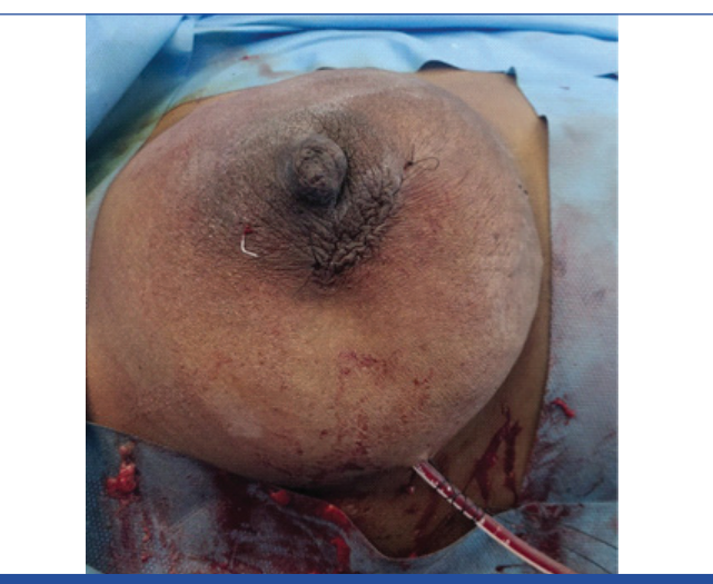
[Table/Fig-2]: Operative photograph of primary closure with negative suction drain.

Dressing was done after first 48 hours in both groups and in primary closure group subsequent dressings were done only if there was any soakage of the dressing and in open drainage group dressing was done daily until healthy granulation tissue was noticed [Table/Fig-2,3].