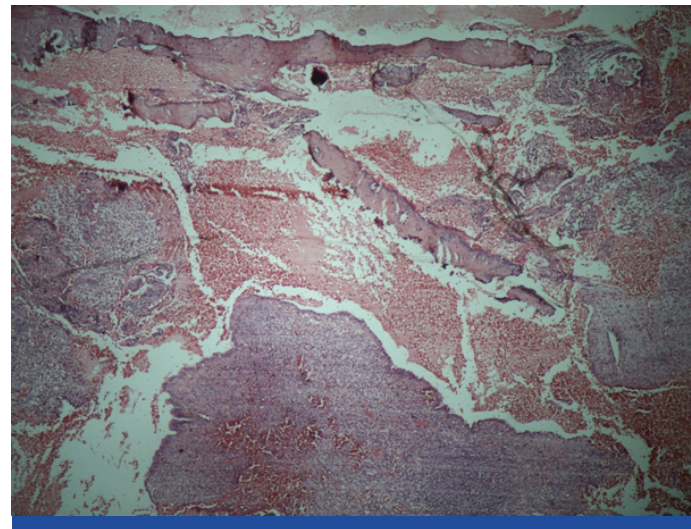
[Table/Fig-2]: Photomicrograph showing endometrial tissue with fragment of woven bone (H and E; x 40)

to endometrial ossification, is either increased prostaglandin production as proposed by Marcus et al [8], or its action as an intrauterine contraceptive device.