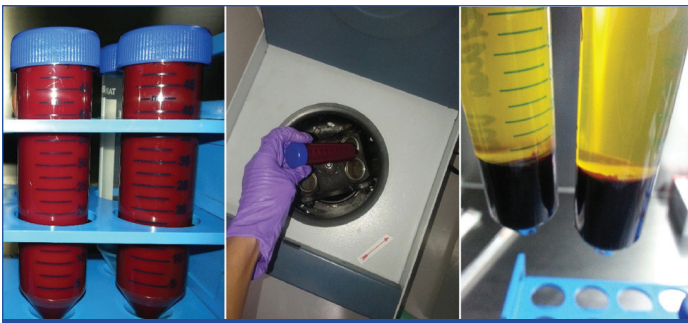
[Table/Fig-1]: Showing collection of patient's own blood in 50 mL tube, centrifuging them and obtaining about 10 mL PRP in the lower layer.