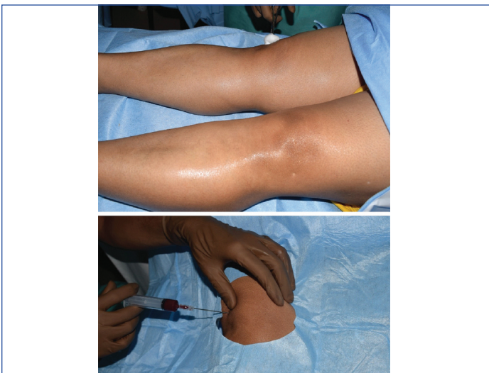
[Table/Fig-2]: Showing the autologous derived PRP being given intra-articular into the knee under sterile aseptic conditions.

making a percentage of 56% and 44% respectively. Two patients developed superficial tenderness at injection site which healed within a week by analgesics alone. WOMAC scores compared individually for pain, stiffness and physical function at 1 st , 3 rd and 9 months post PRP injection versus pre-injection [Table/Fig-4] showed statistical significance with p-value less than 0.001 for almost all except for pain at 1 st month ( p=0.2408 ) as shown in the [Table/Fig-5].