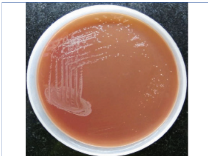
[Table/Fig-2]: Non lactose fermenting, mucoid, smooth colonies of Burkholderia cenocepacia on MacConkey agar plate, after 48 hrs of incubation at 37°C in aerobic condition.