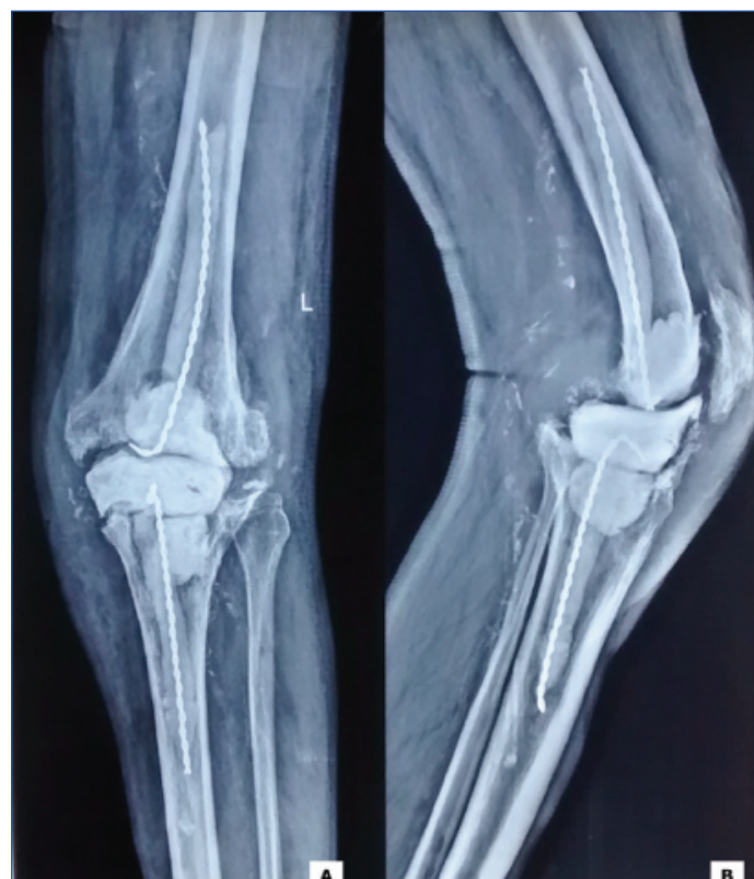
[Table/Fig-1]: X-ray Left Knee in Anteroposterior (a) and Lateral (b) view showing the antibiotic cement spacer in situ following the first stage revision surgery for periprosthetic joint infection.

Environmental samples including hospital water supply, cleaning and disinfectant solutions, intravenous fluids, swabs from the dressing trolley, bed railing, mattress and personnel attending the patient were collected to determine the source of infection. All the samples were culture negative for B. cenocepacia .