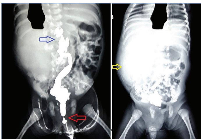
[Table/Fig-4]: a) Contrast imaging showed bladder wall irregular with tiny diverticula noted, Grade 4 VUR noted at right side (blue arrow), no VUR on left side in present film. Posterior urethra fusiformly dilated with abrupt narrowing suggesting PUV (red arrow); b) Postvoid MCU film showing diffuse spreading of dye on the right side (yellow arrow).

Diagnostic fluid aspiration from the mass, revealed a straw coloured fluid, which had an acidic reaction to litmus paper. Fluid biochemistry showed a creatinine value of 221.8 mg/dL, confirmed it to be urine. An Micturating Cysto-Urethrogram (MCU) was done next, as the renal function was within normal limit. It showed an irregular bladder with tiny diverticula. A grade IV: Vesico-Ureteral Reflux (VUR) with dilatation of ureter was noted on the right side [Table/Fig-4a]. No VUR was noted on the left side in the present film. Posterior urethra was fusiformly dilated with abrupt narrowing suggesting a Posterior Urethral Valve (PUV). Diffuse spreading of dye (extravasation) noted