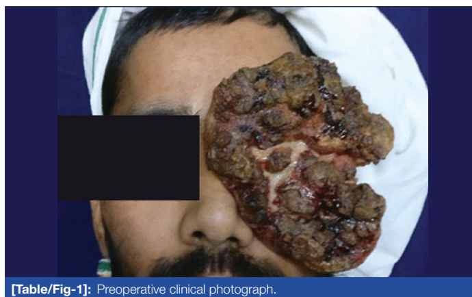
[Table/Fig-1]: Preoperative clinical photograph.

On general physical examination, the patient was anaemic. His right eye was within normal limits. On the left side, there was a fungating, multi-lobulated mass of about 10 X 10 cm in size with areas of necrosis and secondary infection [Table/Fig-1]. No orbital structure