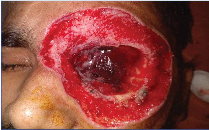
[Table/Fig-3]: Postoperative day 1. Multiple areas of bone necrosis are seen (arrows).

achieved and the cavity was packed with antibiotic impregnated gauze. The excised tumour tissue was sent for histopathological assessment (Paraffin preparation, Haematoxylin and eosin staining and Immunohistochemistry). Due to the large size and extensive vascularity of the lesion, there was excessive blood loss and the patient received two units packed cells and two units of fresh frozen plasma perioperatively. Postoperatively, the patient received intravenous ceftriaxone 1 gm iv BD for seven days, tablet ibuprofen 400 mg TDS for three days and tablet ethamsylate 250 mg TDS for three days. Tab entecavir was continued and the patient was on high protein diet and dietary supplements to help in recovery. Antiseptic dressing was done every three days and the wound was allowed to heal by secondary intention by granulation. Histopathology using paraffin preparation and immunohistochemistry (markers used- cytokeratin 5/6, Epithelial Membrane Antigen) revealed