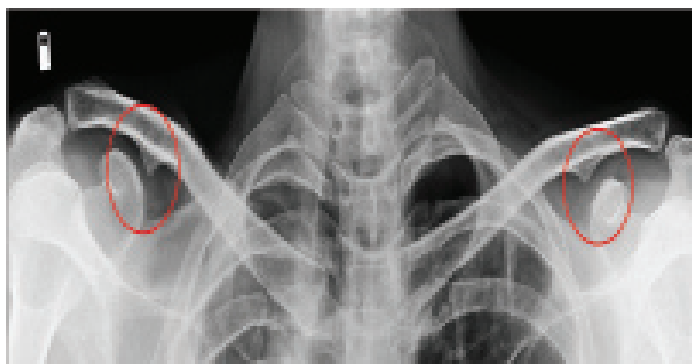
[Table/Fig-3]: Radiograph of thoracic region (PA view) of 40-year-old male showing bilateral presence of coracoclavicular joint (red encircled area).

insignificant. While observing gender wise distribution, the joint was found to be more prevalent among males but the difference between the two was statistically insignificant [Table/Fig-5]. Gender was not found to be significantly associated with presence, laterality or sidedness of joint [Table/Fig-6]. All those individuals in whom CCJ was present were above 21 years of age.