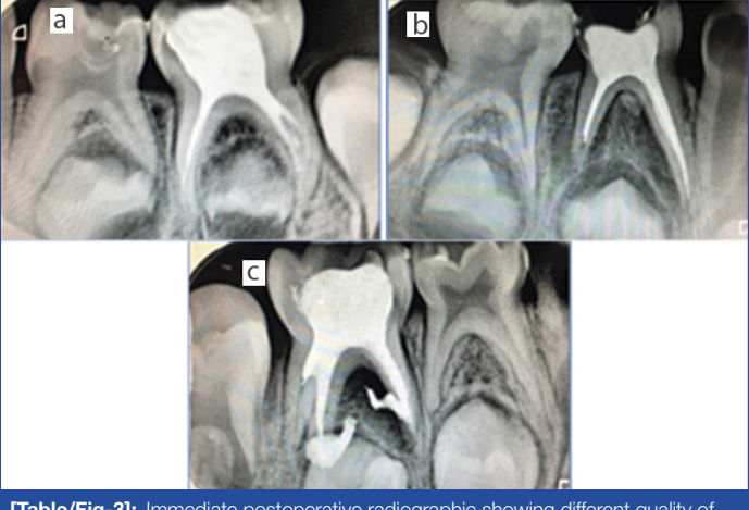
[Table/Fig-3]: Immediate postoperative radiographic showing different quality of obturation a) under filling; b) optimal filling; c) over filling.