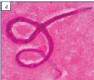
[Table/Fig-1]: a) Shows microfilaria, spermatogonia and few inflammatory cells (H&E-20X). b) Shows a microfilaria and few inflammatory cells (H&E-40X). The curves of microfilaria were round with broad cephalic end. c) Larvae had double row of nuclei (H&E-100X). d) Nuclei did not extend upto the tip of tail end of parasite, suggesting a diagnosis of Wuchereria bancrofti (H&E-40X).