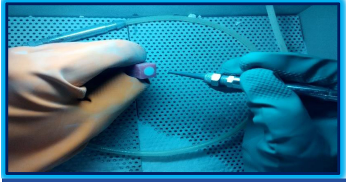
[Table/Fig-2]: Sandblasting of zirconia specimens.