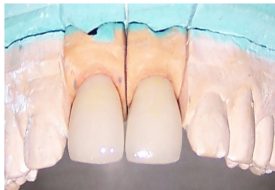
(Table/Fig 6) Crowns on cast to check for fit and contacts