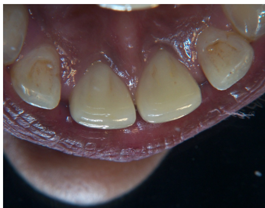
(Table/Fig 8) Intraoral view of the crowns