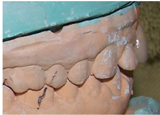
(Table/Fig 5) Post treatment cast with crowns showing degree of repositioning.