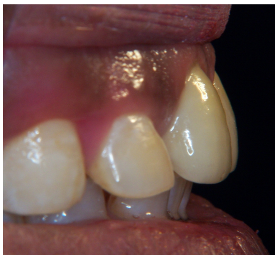
(Table/Fig 9) Profile view of crowns