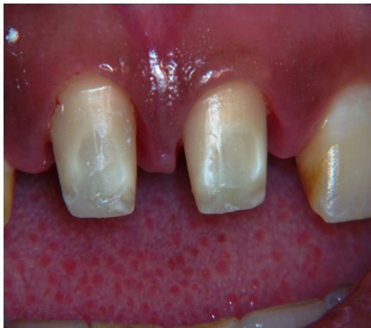
(Table/Fig 3) Prepared abutments 11&21