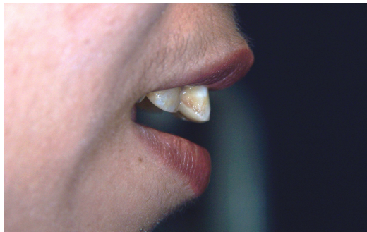
(Table/Fig 2) Profile view showing discoloured 11.