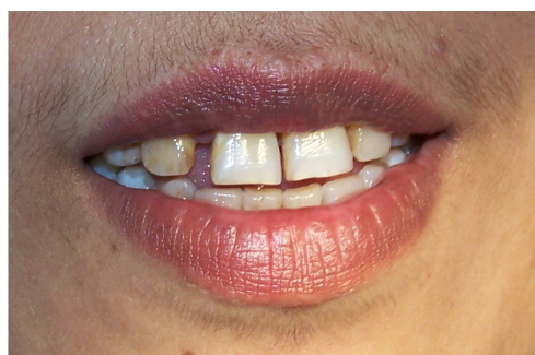
(Table/Fig 1)Proclined central incisors labial view.

The Procera crowns were returned from the dental laboratory [Table/Fig 4] and [Table/Fig 5] The crowns were examined on an uncut solid model for fit and contacts [Table/Fig 6] In the next appointment, the temporary crowns were removed, both the abutments were cleaned of the temporary cement and the crowns were tried in both individually and together to assess the marginal fit and contacts. The patient previewed and approved the shape and the shade of the crowns. Both the Procera crowns were cemented with a reinforced glass ionomer luting cement (GC Fuji Plus,GC, Alsip,III.) [Table/Fig 7], [Table/Fig 8], [Table/Fig 9] and [Table/Fig 10]. Postoperative care instructions were given to the patient and recall appointments were scheduled.