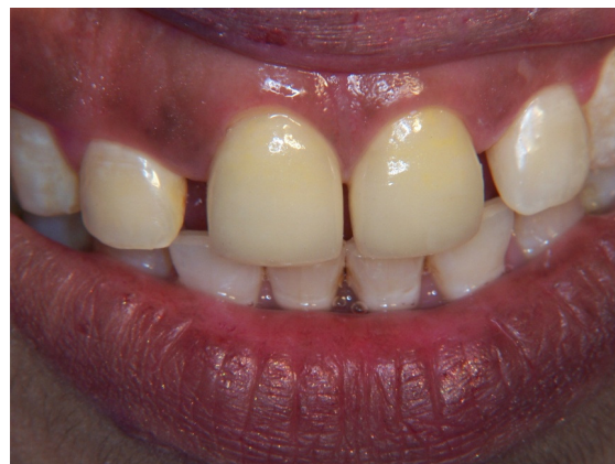
(Table/Fig 7) Labial view of restored crowns