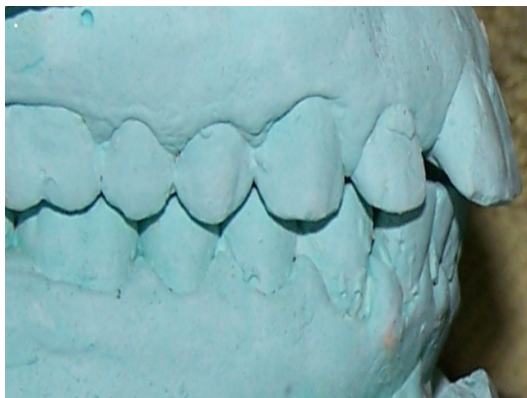
(Table/Fig 4) Pre treatment model, showing proclined 11&21