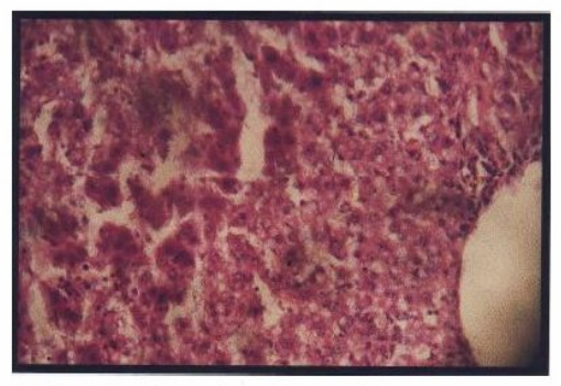
(Table/Fig 5) Section of the liver tissue of Silymarin treated animals showing normal hepatocytes with central hepatic vein. (100X)

(Table/Fig 4) Section of the liver tissue of ethanolic extract of pulp of Eugenia jambolana treated animals showing normal arrangement of hepatocytes, absence of necrosis and mild fatty changes. (100X)