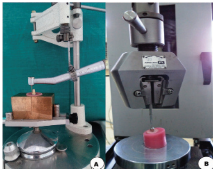
[Table/Fig-2]: a) Tooth was prepared using a high speed rotary handpiece mounted in a dental surveyor; b) Specimen placed on UTM (Instron 3382) for loading.

The data was analysed using Statistical Package for Social Sciences, version 15.0, distributions were checked for normality using Kolmogorov Smirnov test and failure mode was recorded and statistically analysed with Kruskal Wallis test.