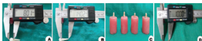
[Table/Fig-1]: a) Dimension of crown measured using an electronic digital Vernier's caliper; b) Dimension of root measured using an electronic digital Vernier's caliper; c) Specimens mounted into resin filled moulds using an electronic digital Vernier's caliper; d) Length of the post (standardized) using an electronic digital Vernier's caliper.

Distilled water was selected to store the specimens at a temperature of 37°C with 100% humidity for 24 hours. Subsequently the specimens were thermocycled for 500 times from 5° to 55°C using 30 second dwell times. The mounted specimens were aligned with the long axis of the tooth at 30° to the loading rod tip. This jig was secured to the lower compartment of a Universal Testing Machine (UTM) (Instron 3382). A flat steel tip with compressive head was used to apply the load on lingual incline of buccal cusp. It was fixed to the moving upper compartment of the testing machine [Table/Fig-2b]. The compressive load was applied at a crosshead speed of 1 mm/min until failure occurred. The failure mode was evaluated by visual examination of the specimens to classify its type [13]. Then a stereomicroscope (Olympus, U-CMAD3, Japan) was used for further evaluation of the mode of failure. The failure mode was classified as either favourable (restorable) or unfavourable (catastrophic) [Table/Fig-3a,b]. Favourable failure modes are those that take place above the level of acrylic resin which simulate the bone level. They include either partial or complete post-core-crown debonding or post-core-tooth complex fracture above acrylic resin block. Unfavourable failure occurs below the level of the acrylic resin. It includes fracture of the post-core-root complex, cracks in the roots or vertical root fractures.