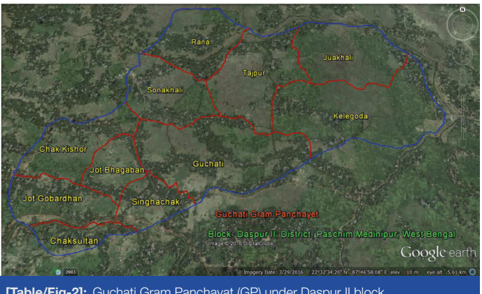
[Table/Fig-2]: Guchati Gram Panchayat (GP) under Daspur II block

per capita monthly income, and latitude, longitude and second part was AUDIT [17] questions. During data collection real time synchronisation between Epi Info application in smart phone and Epi Info™7 software in Windows platform based personal computer, was made using cloud computing (Microsoft Azure) technology. Collected data were recorded automatically into the computer Epi Info™7 database in real time manner.