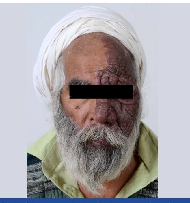
[Table/Fig-1]: A 55-year-old male patient with a large progressive hemangiomatous lesion (portwine stain) over the left half of the face in V1 and V2 distribution. V1- ophthalmic and V2- maxillary

Treatment is symptomatic with antiepileptics, antiglaucoma drugs and laser therapy for portwine stain. Low dose Aspirin has been