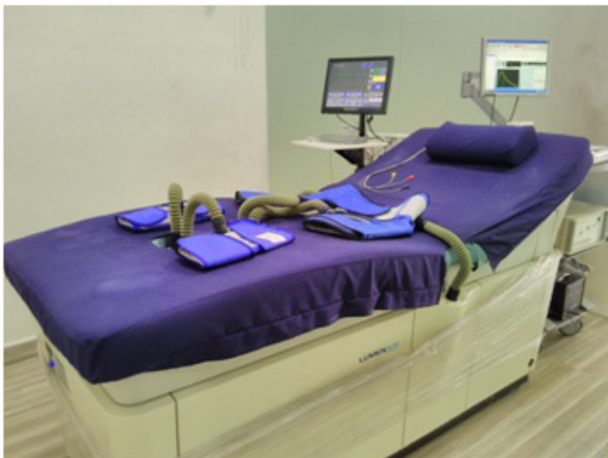
[Table/Fig-1]: Enhanced external counter pulsation (EECP) station.