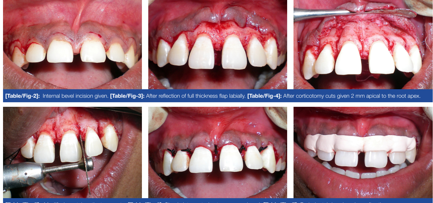
[Table/Fig-5]: Modified crestal corticotomy cuts. [Table/Fig-6]: Simple interrupted sutures were placed. [Table/Fig-7]: Periodontal dressing given after the surgery.