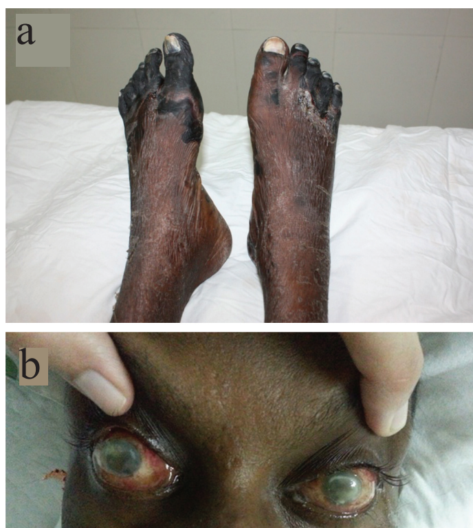
[Table/Fig-1]: (a) Bilateral dry gangrene of lower limbs; (b) Bilateral redness in both eyes; Diagnosed with endophthalmitis