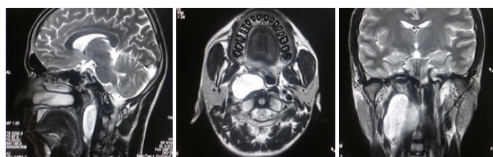
[Table/Fig-2]: MRI picture of vagus nerve neurofibroma (sagittal). [Table/Fig-3]: MRI picture of vagus nerve neurofibroma (axial). [Table/Fig-4]: MRI picture of vagus nerve neurofibroma (coronal).