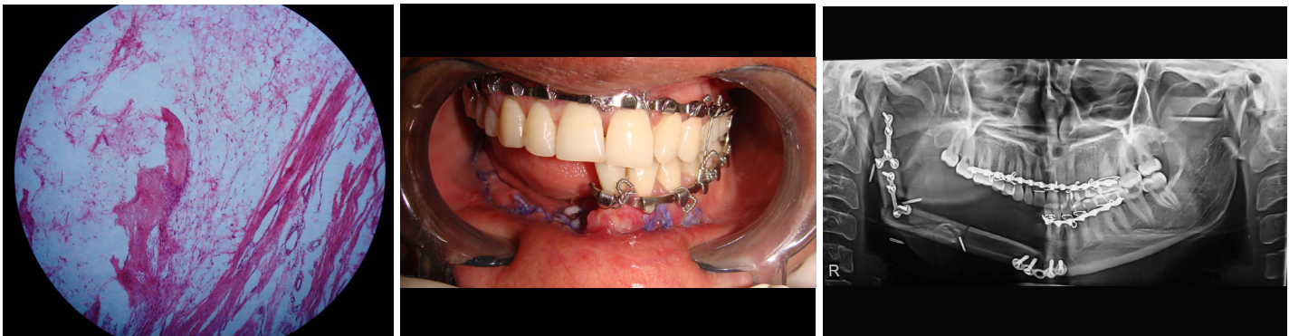
[Table/Fig-7]: H & E section shows a loose myxomatous stroma. [Table/Fig-8]: Post-operative intraoral photograph shows Vicryl sutures placed over the surgical site of the hemisectioned right half of the mandible with intermaxillary fixation done on the left side. [Table/Fig-9]: Post-operative radiograph shows resection of mandible on the right side with preservation of condyle and coronoid process and placement of an 'L' shaped reconstruction graft fixed with three bone plates one in the anterior region and two in the ramus region.

On microscopic examination, the stained H & E section showed a loose myxomatous stroma. The stroma made up of stellate shaped cells with long cytoplasmic processes anastomosing with each other. Each cell has a prominent darkly staining nucleus. A few fibroblasts and collagen fibers were seen in between the myxoid stroma. The histopathology report was suggestive of a diagnosis of odontogenic myxoma [Table/Fig-7].