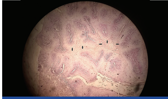
[Table/Fig-2]: Microscopic view showing Schneiderian papilloma (inverted papilloma) showing bulbous downward (inverted) growth of squamous epithelial cell proliferation into underlying stroma with dysplastic changes.